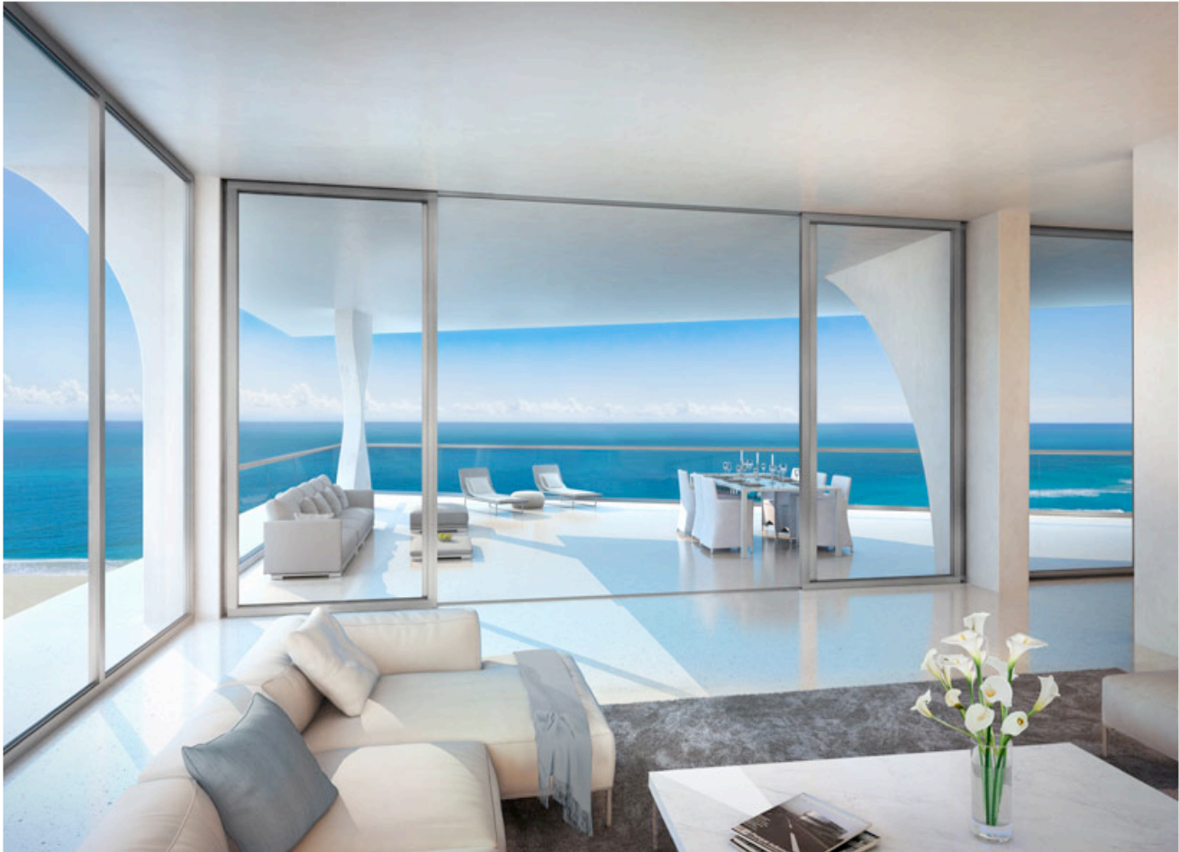
generous glazing opens the units to the ocean and wide balconies image © jade signature