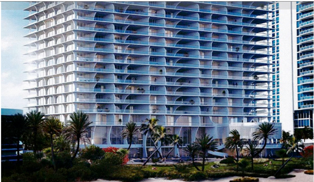
orthogonality in weathered in favor of a more considered design image © bogatov realty