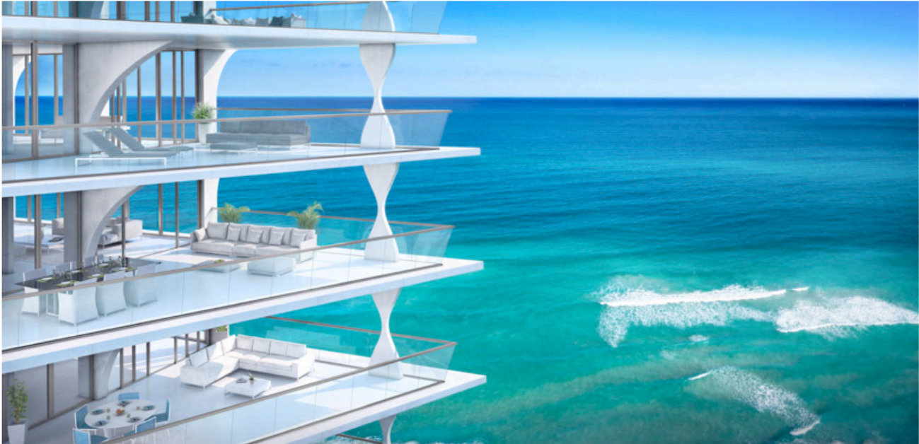
curved columns lend the tower architectural definition