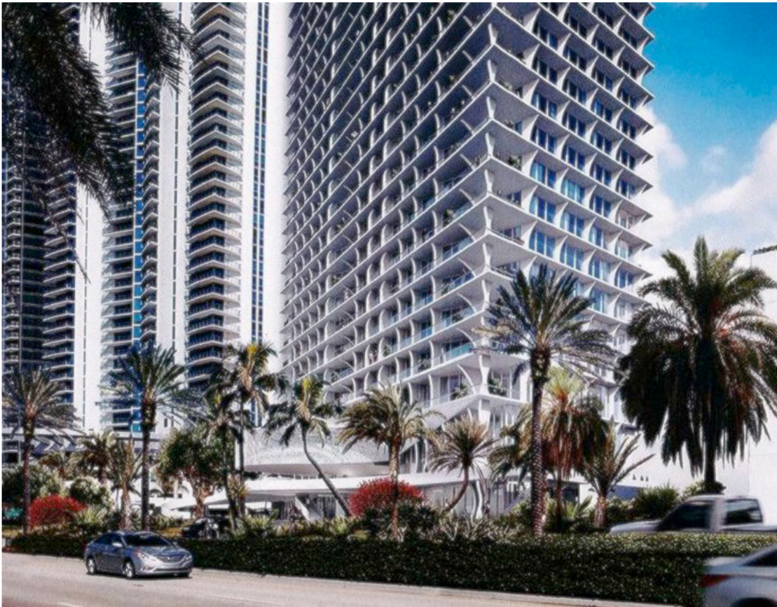
view of the proposed tower up through the setback unit